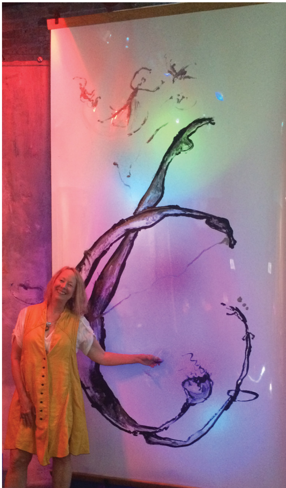
The first plastic white backlit panel exhibited during the July 2015 4th Friday open studios in leveille's "incubation installation experimentation exhibition" art studio - 204F at Starline in Harvard, IL.

Lake Geneva Art Museum sponsored storefront installation