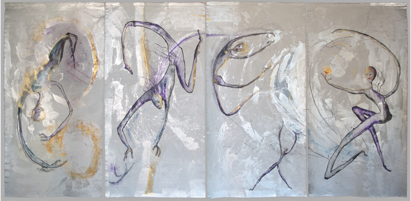
"Nano Waves 1, 2, 3 & 4," metallic and acrylic paint on unstretched canvas