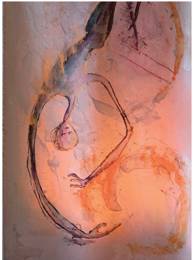
"Nano waves" detail installation view with LED changing colored lighting