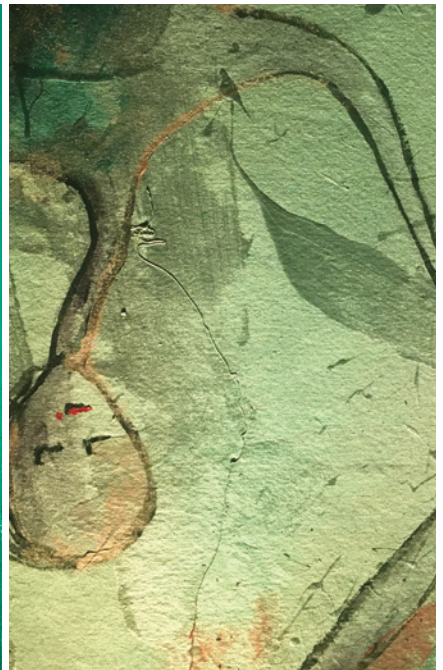
"Nano Waves" details, installation view with LED changing colored lighting