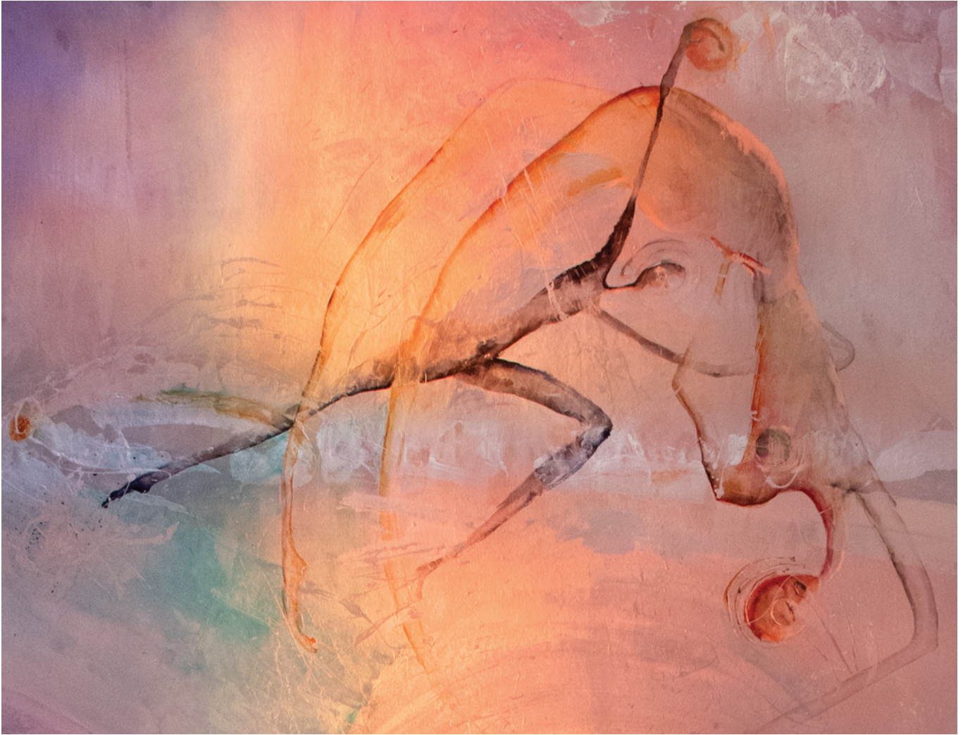
"Moon Dance", 10' x 12', metallic and acrylic paint on unstretched canvas, installation view with LED changing colored lighting, detail