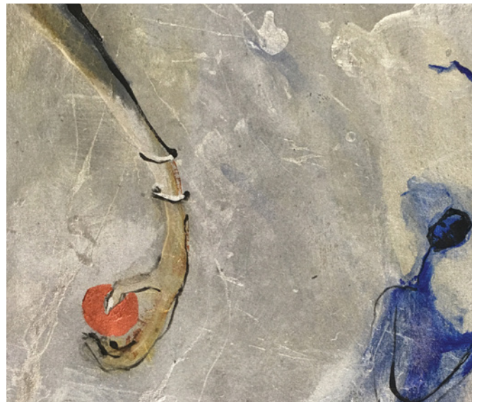
"Cross-Over", 10' x 22' - metallic and acrylic paint on unstretched canvas, details