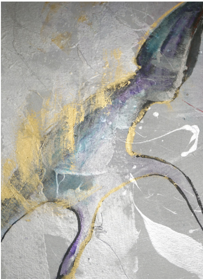
"Nano Waves" detail