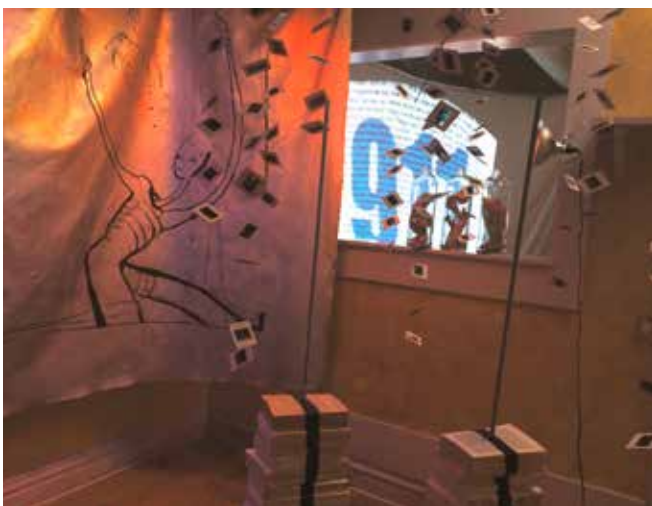
"911" installation view with LED changing colored lighting, video; sculpture by Angela Swan; and music by Cellmod