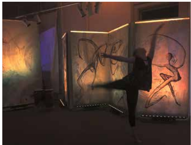
"streaming reflections" installation view with LED changing colored lighting, dancer Ellyanna Hope Anderson