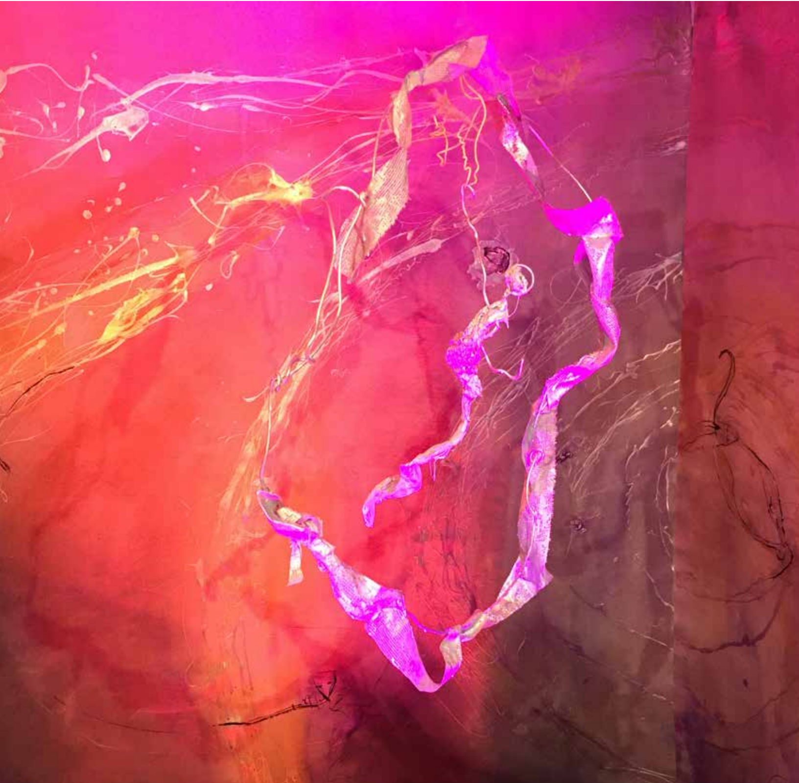
"synapse" detail, installation view with LED changing colored lighting