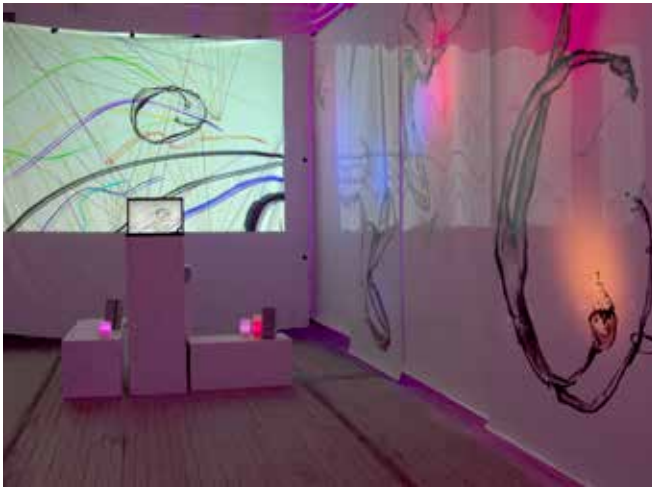
"the END is the beginning" installation view with LED changing color back-lit lighting and animation video