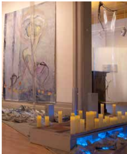
"Bridges" installation view with blue LED lighting, led candles and walkable bridge