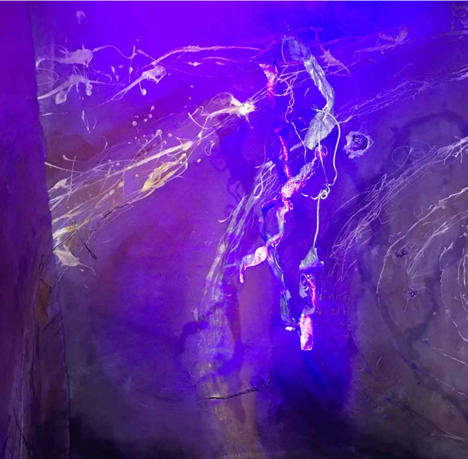
"synapse" detail, installation view with LED changing colored lighting