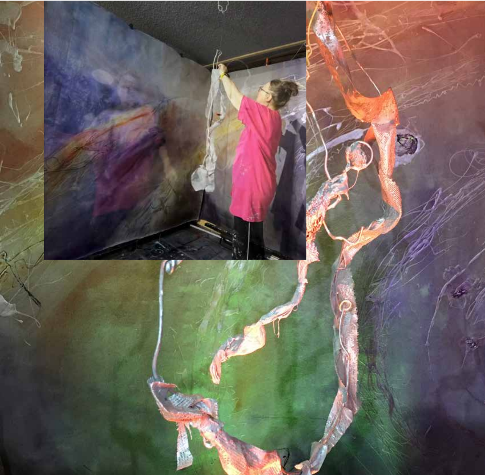
insert: bert leveille in her studio creating the 3-D piece for the "synapse vault installation" "synapse" detail, installation view with LED changing colored lighting