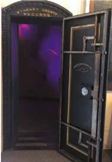
“LISTEN TO COLOUR”